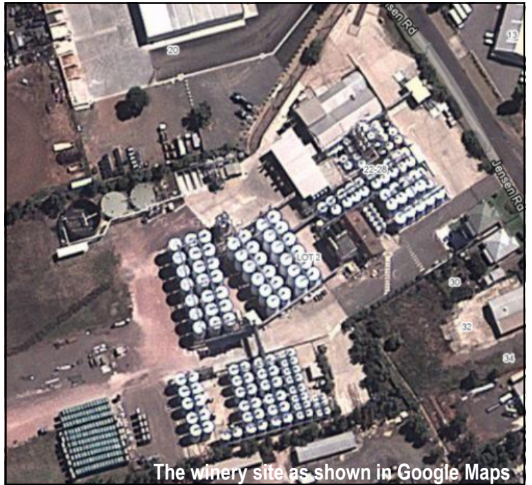
The winery site as shown in Google Maps

The site has a capacity 30,000 tonnes, it closed in 2010. If this level is required by the new owners the region is set to benefit.