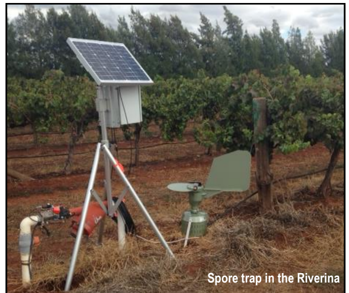
Spore trap in the Riverina

grown in recent years with the true cause not fully understood. On the 25 th March the team of researchers from the National Wine Grape Industry Centre and SARDI together with the Wine Grapes Marketing Board installed a spore trap at the Hanwood DPI viticulture station. This trap is designed to collect spores carried in the air over 30 days with the range of spores present to be analysed to determine if there is a trend in the appearance of certain disease causing spores in the local atmosphere. This 3 year project will present growers with knowledge of when spores are most likely to be in the atmosphere, which will assist with farm management to avoid the time of elevated disease risk.