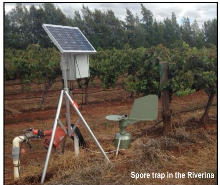
Spore trap in the Riverina

grown in recent years with the true cause not fully understood. On the 25 th March the team of researchers from the National Wine Grape Industry Centre and SARDI together with the Wine Grapes Marketing Board installed a spore trap at the Hanwood DPI viticulture station. This trap is designed to collect spores carried in the air over 30 days with the range of spores present to be analysed to determine if there is a trend in the appearance of certain disease causing spores in the local atmosphere. This 3 year project will present growers with knowledge of when spores are most likely to be in the atmosphere, which will assist with farm management to avoid the time of elevated disease risk.