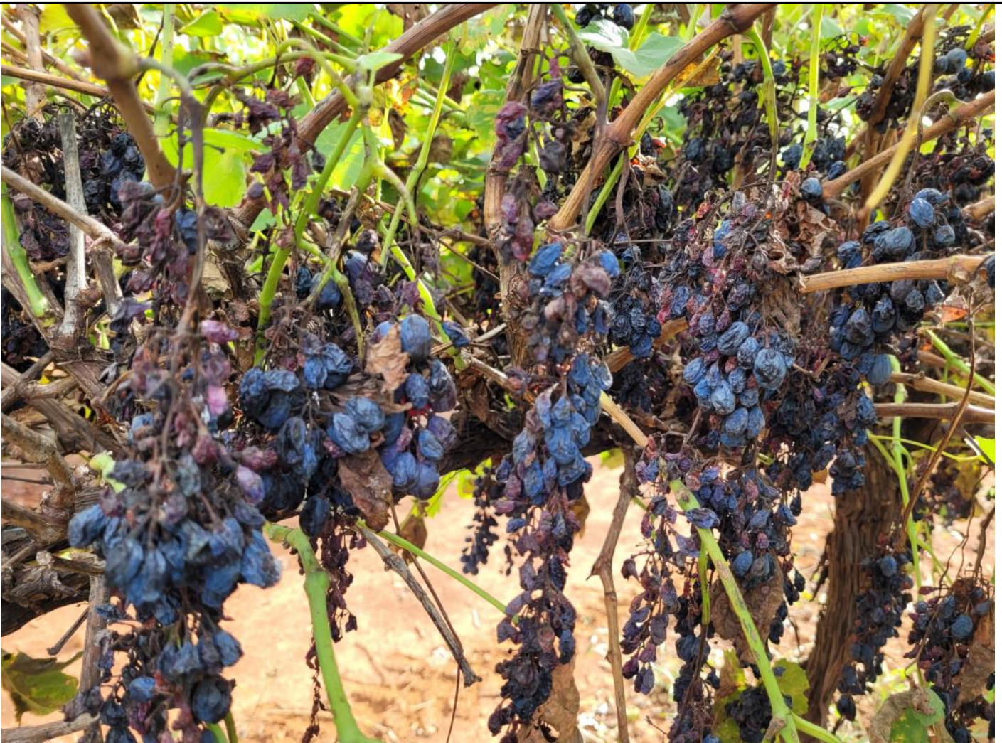
Hail Affected vineyard that didn't make it to the winery